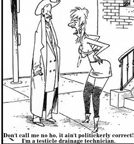
Don't call me no ho, it ain't politickierly correct! I'm a testicle drainage technician.

"Just wait a moment, be patient," said the hit man calmly, "I think I can save you a grand here..."