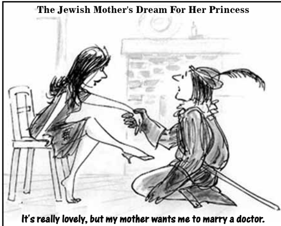
The Jewish Mother's Dream For Her Princess

Hyman replies, "So vat did I say? All that I said wuz, 'The Rabbi said for cough'."