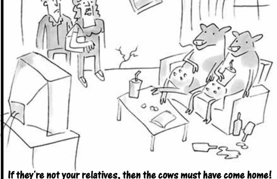
If they're not your relatives, then the cows must have come home!

When she gets to the Golders Green restaurant, she is shown to her table, her date has not