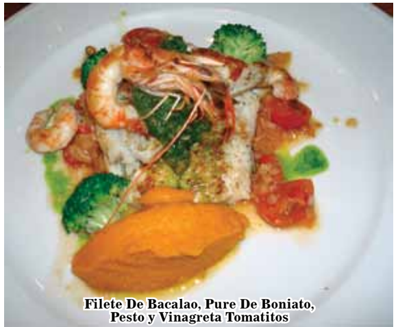
Filete De Bacalao, Pure De Boniato, Pesto y Vinagreta Tomatitos

Juicy bacalao chunks with cherry tomatoes, pureed sweet potatoes