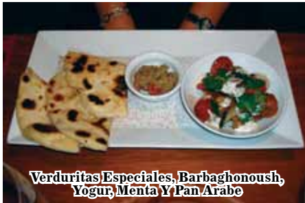
Verduritas Especiales, Barbagonoush, Yogur, Menta Y Pan Arabe

A Middle Eastern dish, similar to humus, the