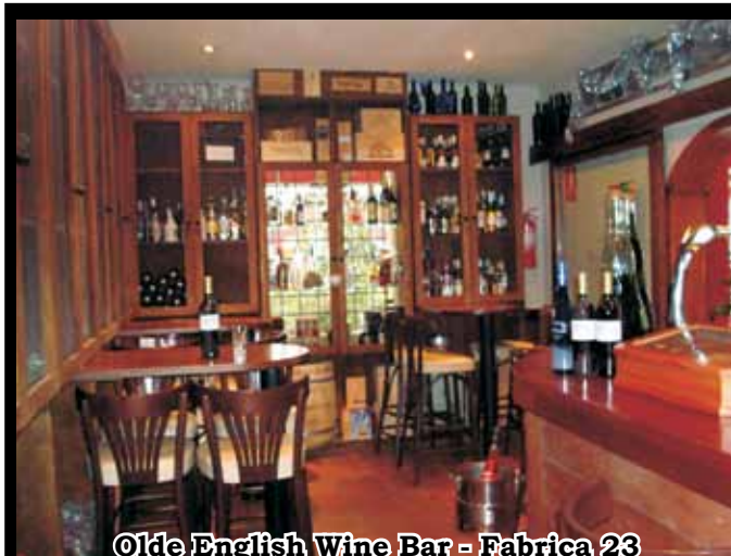
Olde English Wine Bar - Fabrica 23

C/. Cotoner, 42, Santa Catalina, 07013 Palma de Mallorca www.fabrica23restaurant.com