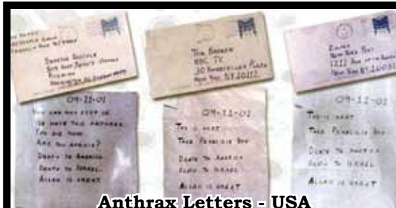
Anthrax Letters - USA In the days following 9/11, Anthrax-laced letters, mailed to media and U.S. senators, killed five people and spread fear and panic throughout the nation.

There has been no coroner's inquest into Dr David Kelly's death, the specialist medics say the Hutton Inquiry's finding of suicide was flawed.