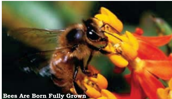
Bees Are Born Fully Grown

Maybe governments should start to legislate for humanitarian value, and not simply to win votes.