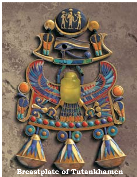
Breastplate of Tutankhamen