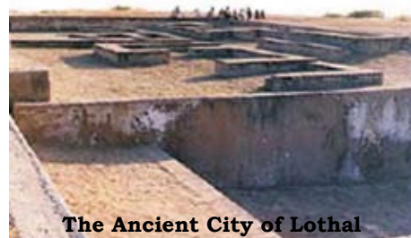
The Ancient City of Lothal

The flames even reached Heaven... Indra without loss of time set out for Khandava and covered the sky with masses of clouds; the rain poured down but it was dried in mid-air by the heat.