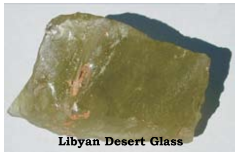
Libyan Desert Glass

The glass has generated intense interest among scientists because its origin remains an enigma. Was it produced by the encounter of an